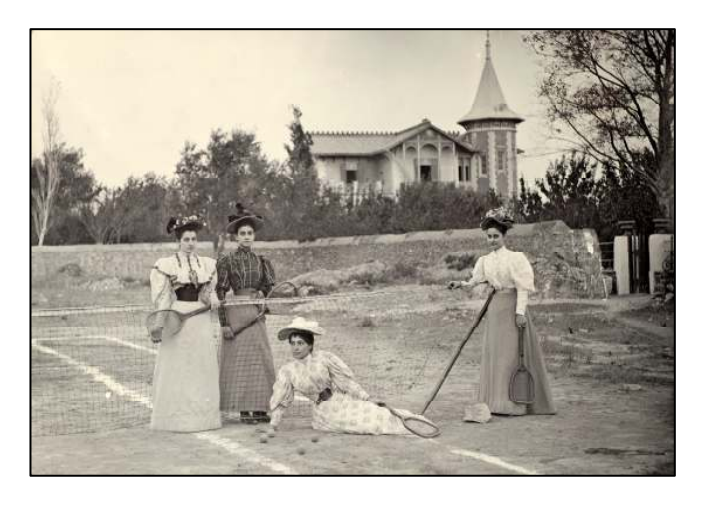
Photo on tennis court. Athens, circa1900. Eftaxias. Benaki Museum Photographic Archive

DECEMBER 6<sup>th</sup> 2007 – MAY 4<sup>th</sup> 2008