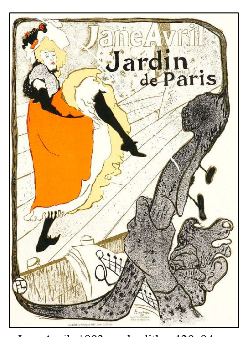
Jane Avril- 1893 - color litho, 129x94cm

DECEMBER 6<sup>th</sup> 2007 – MAY 4<sup>th</sup> 2008