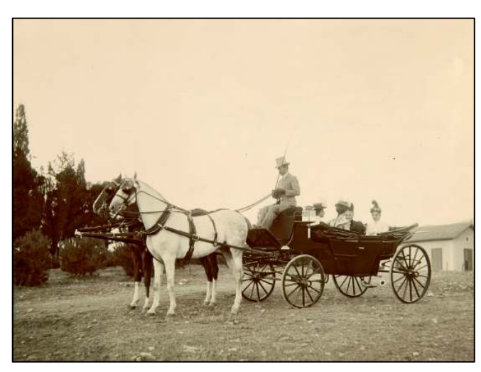
Group in Carriage, Athens, circa.1900, Eftaxias. Benaki Museum Photographic Archive