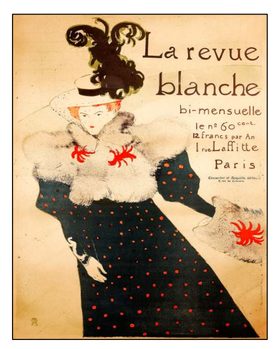
La Revue Blanche - 1895 -color litho,125.5 x 91cm