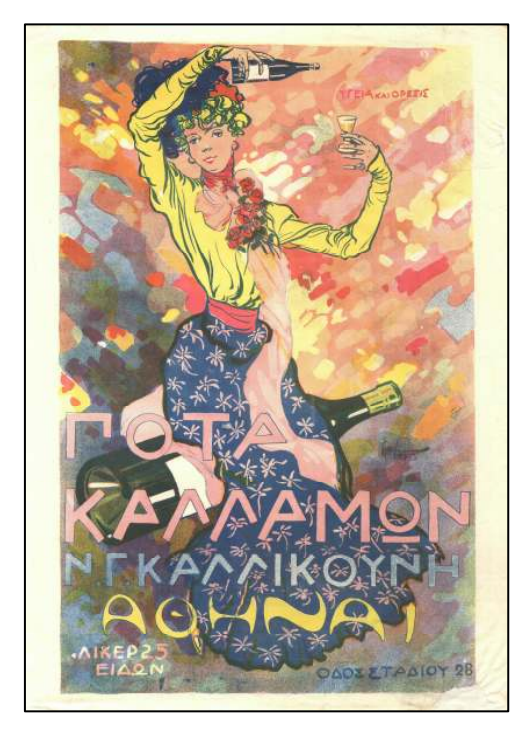
Beverage Advertisement