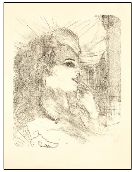
Anna Held - Lithograph-1898, 39 x 32cm