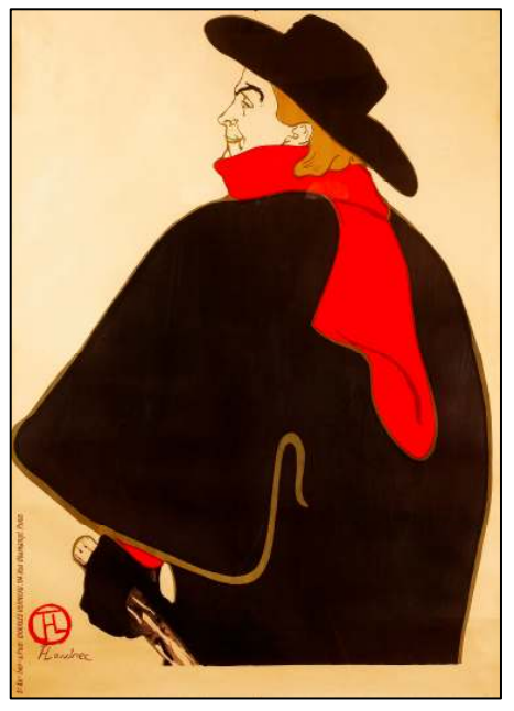
Aristide Bruant dans son cabaret (sans lettres) - 1893, color lithograph 138.5 x 99.2cm